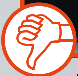
Standard welding torch: strong fume production!